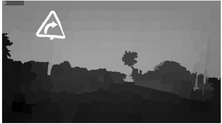
Fig.2.3 Saliency of an input image

The Fig.2.3 shows the saliency image. Further the output we can observe that only the sign board is highlighted which is the region of interest in sign board detection.