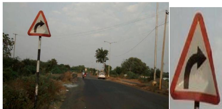
Fig.1.1 Input image for sign board detection (left) which consist of redundant region. Image which consist of only sign board which the region of interest (Right)

In today's growing technology accuracy and speed are the two most vital parameter. When it comes to real time application execution time is important. The driverless car, that is Autonomous car has to make the thousands of decision within fraction of second. In image processing, to identify an object the entire image has to be scanned and processed which is time consuming. Saliency map can be used in such cases were execution time is most important. Saliency map is an intermediate stage which helps to reduce the region of interest neglecting the redundant region. Fig.1.1 shows the example of sign board detection were sign board the region of interest and the remaining region is redundant which can be neglected.