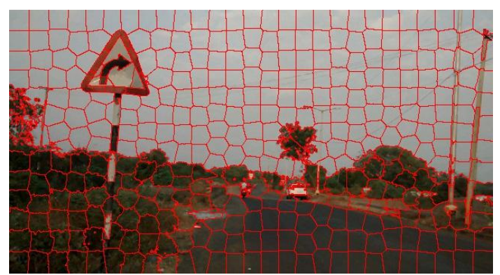
Fig.2.2 The output of image segmentation algorithm

In computer vision, image segmentation is the process of partitioning a digital image into multiple segments. More precisely, image segmentation is the process of assigning a label to every pixel in an image such that pixels with the same label share certain characteristics. In graph based algorithms, each pixel is treated as a node in a graph, and edge weight between two nodes are set proportional to the similarity between the pixels. Superpixel segments are extracted by effectively minimizing a cost function defined on the graph. Fig.2.2 shows the segmented image . The Graph based algorithm performs an agglomerative clustering of pixel nodes on a graph, such that each segment, or superpixel, is the shortest spanning tree of the constituent pixels.